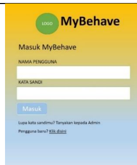
Figure 2. Login