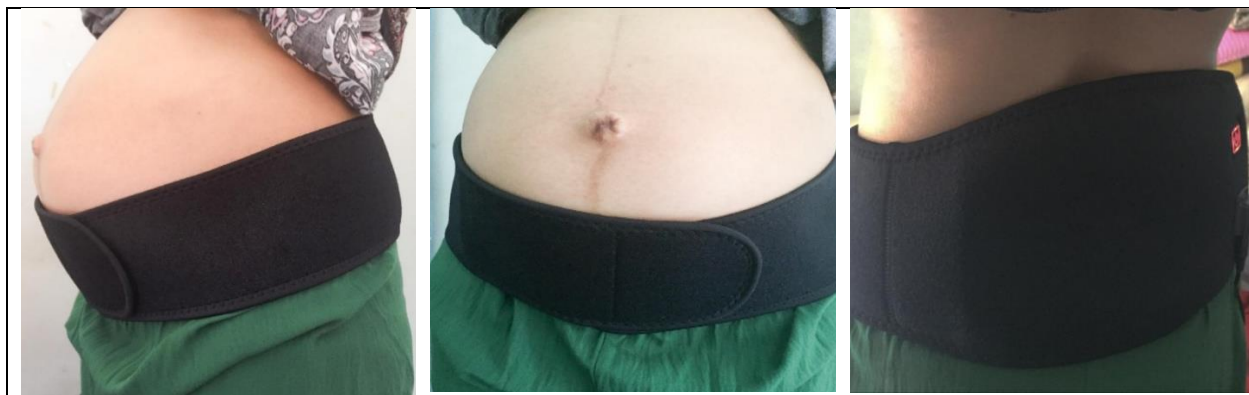
Figure 2. A way of using the relaxation belt