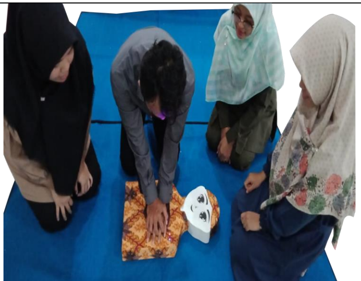
Figure 2. An easy way of using the mannequin