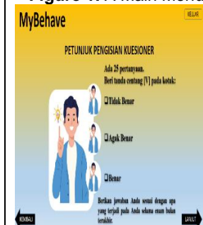
Figure 5. Instructions