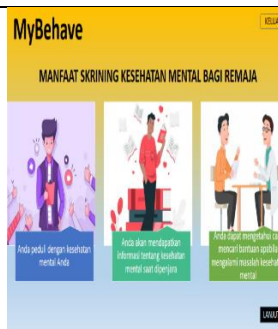
Figure 3. First information