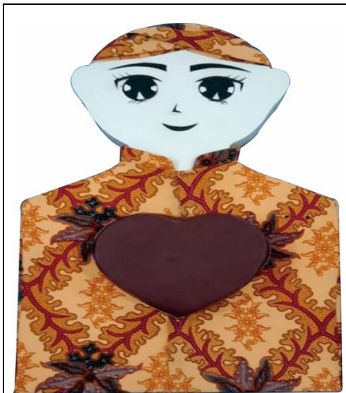
Figure 1. CPR mannequin