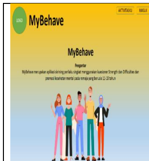
Figure 1. A Main Menu