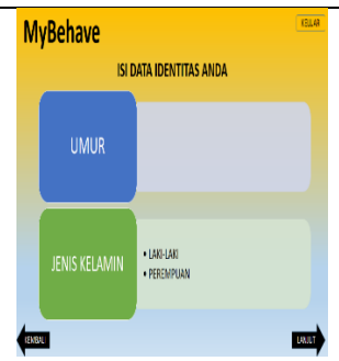
Figure 4. Identity