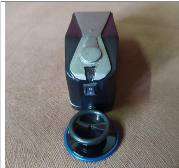
Figure 1. Design of the Electronic Stethoscope