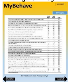
Figure 6. Screening